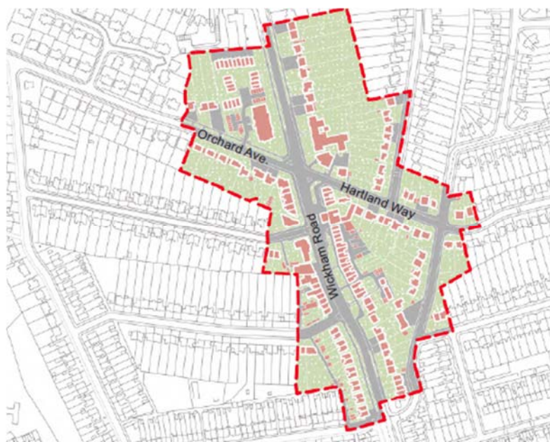
Extract from the Suburban Design Guide showing the site within the Shirley Intensifications Area

8.3 Both the London Plan and the NPPF place significant weight on housing delivery and focus on the roles that intensification and small sites in particular will play in resolving the current housing crisis. The Croydon Local Plan 2018 further identifies that a third of housing should come from windfall sites and suburban intensification, in order to protect areas such as Metropolitan Green Belt. The site is located within an area of Shirley which is defined for focussed intensification within the Suburban Design Guidance adopted in 2019. Within such locations the redevelopment of 2 storey detached properties into small blocks of apartments may be acceptable, with some scope for additional accommodation in the roof space.